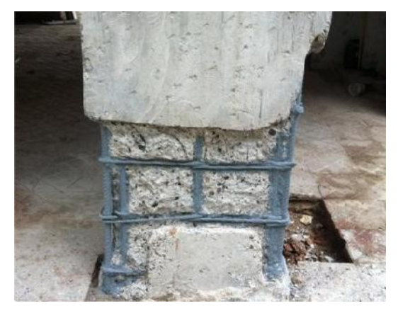
TYPICAL IMAGE OF SURFACE PREPARED RCC MEMBER