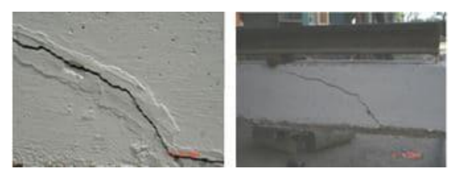
Fig. 2: Repair Cracks in Reinforced Concrete Beams using Polymer Modified Mortar

Polymer-modified mortars are widely used for repair purposes because of their minimized shrinkage and ability to bond with the densest surfaces. It is used for repairing cracks and delamination of concrete structure and cracks.