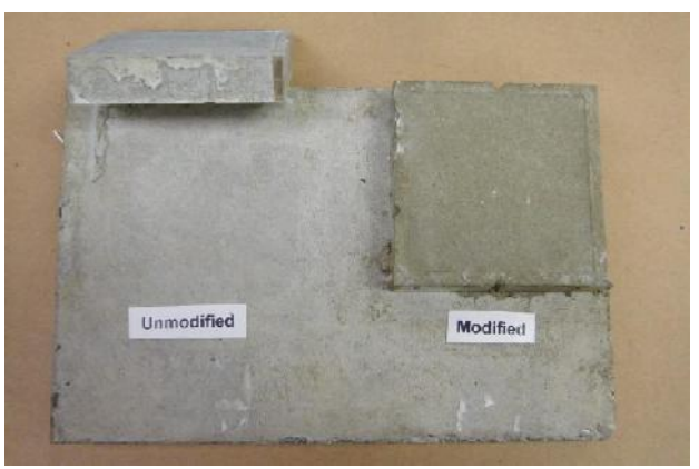
Fig. 1: Polymer Modified Mortar

Finally, since polymer modified mortar requires less water compared to ordinary mortar, it does not experience drying shrinkage as much as traditional mortar.