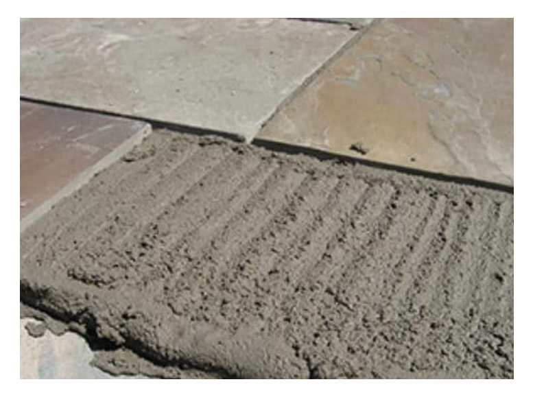
Fig. 4: Use of Polymer Modified Mortar for Installing Tiles