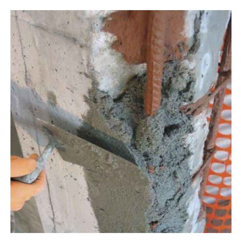
Fig. 3: Polymer Modified Mortar Used for Restoration of Piles